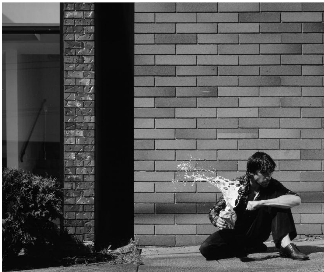
Jeff Wall. Milk , 1984. Photographic transparency in light box.