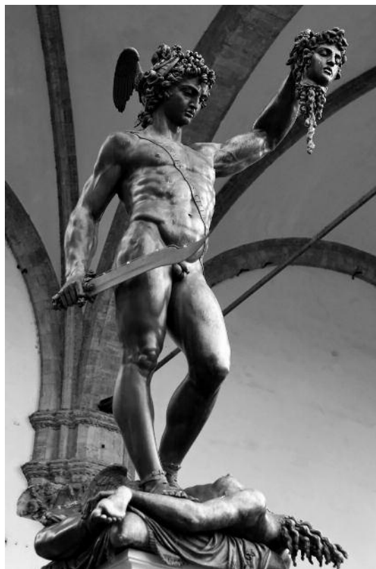
Opposite: Michelangelo Merisi da Caravaggio. Narcissus , 1597–1599. Oil on canvas.