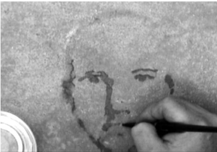
Oscar Muñoz. Re/Trato , 2004. Stills from video.

as the invisible relations that now make us and now bind us; but from them we, too, might be free.