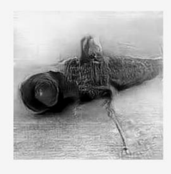
Pierre Huyghe. UUmwelt, 2018. "Mental Image Trio," Pierre Huyghe: UUmwelt, Serpentine Gallery, London (October 3, 2018–February 10, 2019). © Kamitani Lab/Kyoto University and ATR. Courtesy the artist and Serpentine Galleries.

Kamitani Lab's deep neural networks. As a result, we grasp at the resulting images impressionistically and are subjected to the psychological phenomenon of pareidolia (mirroring that "experienced" by the neural network that produced the images in the first place).