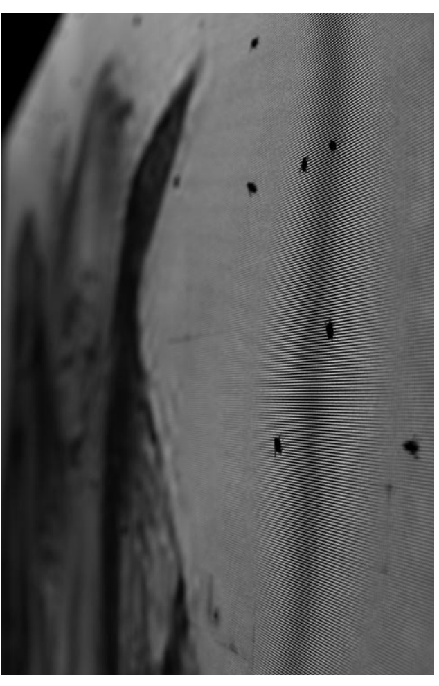
Pierre Huyghe. UUmwelt , 2018. Installation view, Pierre Huyghe: UUmwelt , Serpentine Gallery, London (October 3, 2018–February 10, 2019).

What Huyghe actually puts on show at the Serpentine, though, is our current inability—or, at the very best, partial ability—to reduplicate human visual perception. And he does so by staging the grotesque failure of this project: the monstrous images that result from it are only occasionally legible as anything meaningful and largely consist of distorted, heavily artifacted digital textures in implausible conjunctions. (The failure of this process of cognitive reduplication may also be semantically acknowledged by Huyghe in the truncation of the prefix un- in the titling of UUmwelt.) The machine does not accurately trace images off brainwave data but rather probabilistically extrapolates from sketchily grasped fMRI cues. What results from Huyghe's single-round game of cognitive cadavre exquis between human and machine is grotesquely "surrealistic" imagery. And this imagery induces queasy feelings in its audience because we struggle to reconstruct meaningful reference points from the computationally generated photomontages that emanate from the black box of the